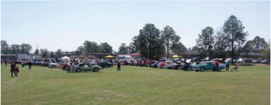
Last year at Ft. Stewart inside the gate. This year, outside the gate and in a parking lot.

Saturday, October 4th 9 am to 3 pm Ft. Stewart Education Center Hinesville, Georgia