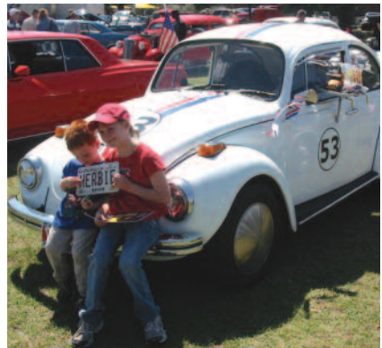
Every kid's favorite

If you are attending we recommend you bring your beach chair, water and other necessities. Also, if you could, please plan on bringing something for the military children - snacks, cookies and candies (all individually wrapped) and some extra soda, water, etc.)